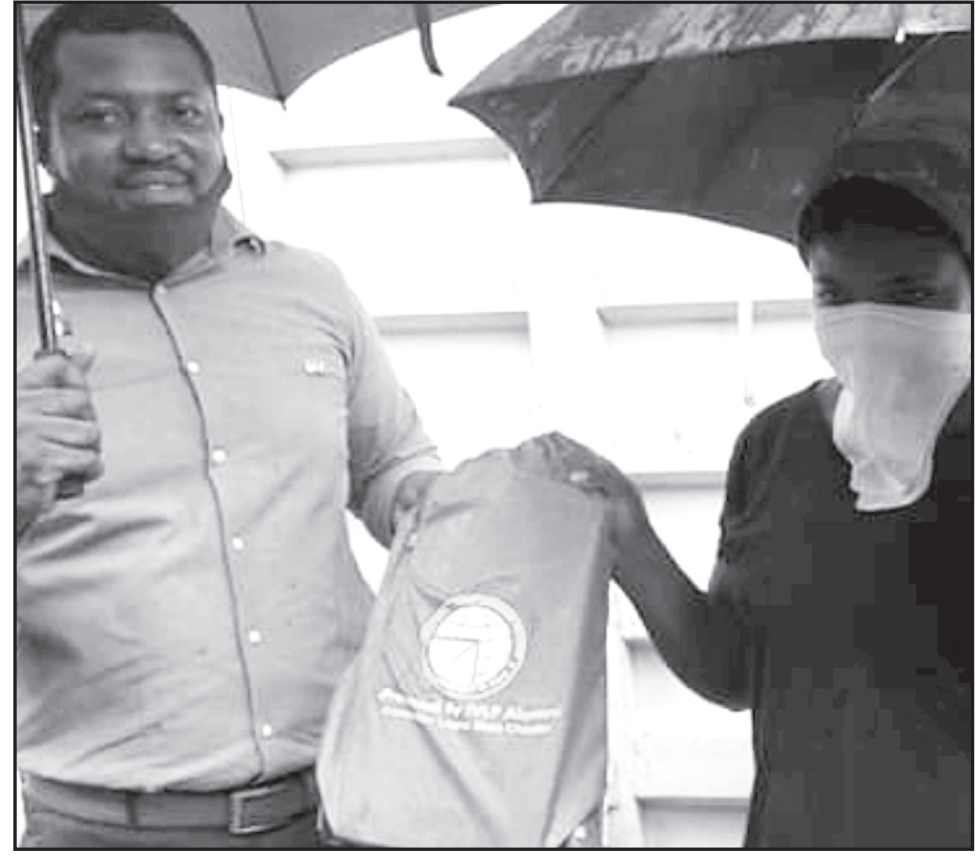
Hon. Remy presenting a backpack containing educational materials to one of the beneficiaries

An excerpt from the statement read: "Kudos to International Visitors Leadership Program Alumni (Lagos Chapter) who distributed educational materials to 120 students at Ajumoni Grammar School,