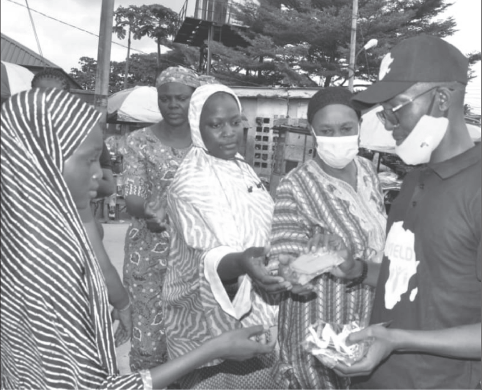
The face mask distribution exercise in Oshodi

He advised the youths to contribute to the society and promised that the foundation would embark on its free skill acquisition training soon.