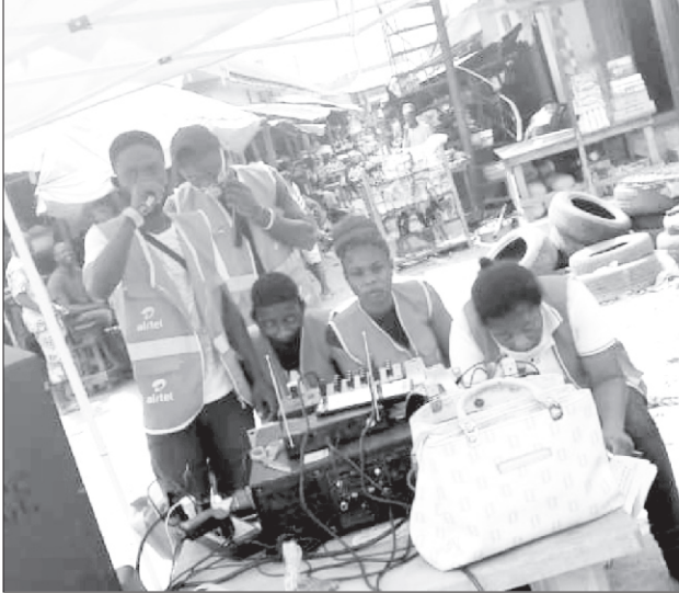
Airtel free sim card in the stores of Mafoluku oja

The customers who wanted to network were required to pay identity card, voter's card or wanted to be identified simply exercise.